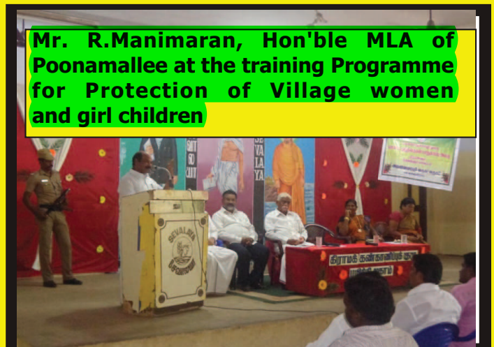
Mr. R.Manimaran, Hon'ble MLA of Poonamallee at the training Programme for Protection of Village women and girl children