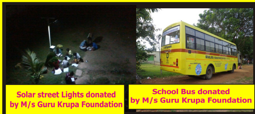
Solar street Lights donated by M/s Guru Krupa Foundation