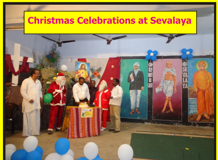
Christmas Celebrations at Sevalaya