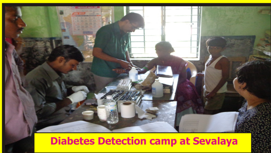
Diabetes Detection camp at Sevalaya