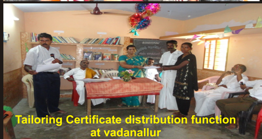
Tailoring Certificate distribution function at vadanallur