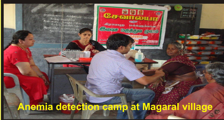
Anemia detection camp at Magaral village

Sevalaya students presented a small cultural programme highlighting environmental issues in today's fast paced life.