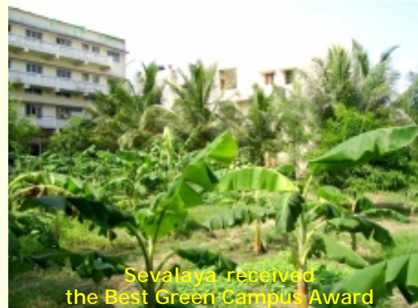
Sevalaya received the Best Green Campus Award

In the last issue we had reported that 'Atma charity wing of IIT donated Rs 50,000 to Sevalaya'. Actually Atma charity wing identifies the beneficiary organizations and the money came from students of IIT through the 'Saarang' program.