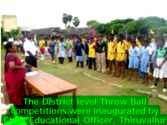
The District level Throw Ball competitions were inaugurated by Chief Educational Officer, Thiruvallur

25 students from 9 th & 11 th standard participated in the second round of quiz programme conducted by Associates of Tata Consultancy Services at their Siruseri office, Chennai on 27/09/2008.